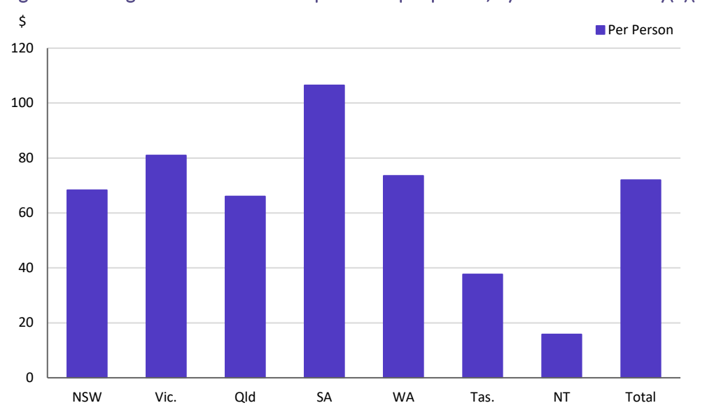
Figure 3. Local government cultural expenditure per person, by state and territory(a)(b)-2019-20

The estimate of total Local government per person cultural funding was $72.01.