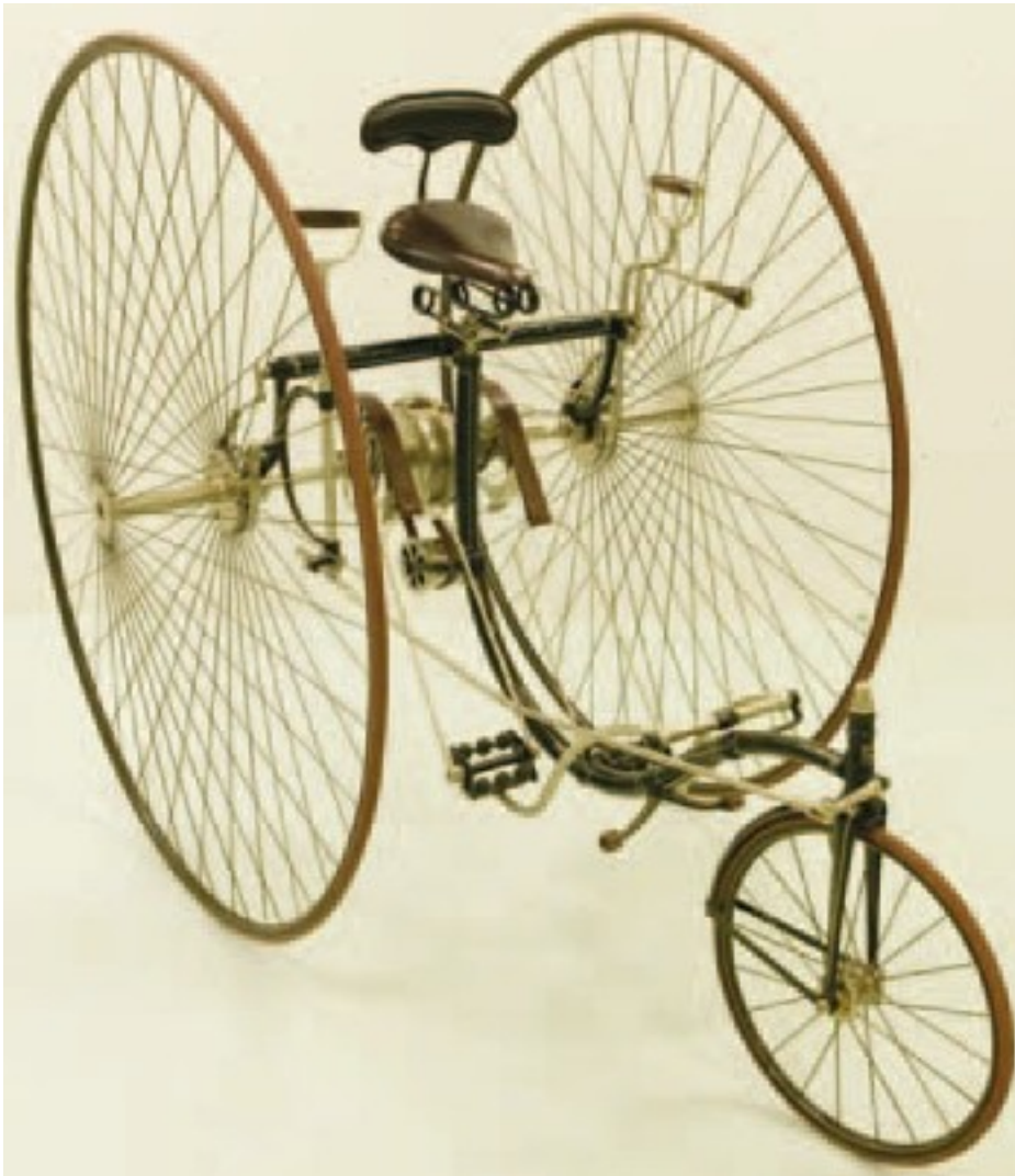
Treadle powered omnicycle 1870s-80s, donated to Museum Victoria