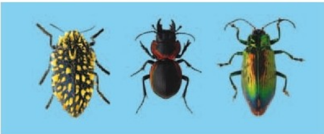
Oological collection donated to the CSIRO Beetle collection donated to the Tasmanian Museum and Art Gallery