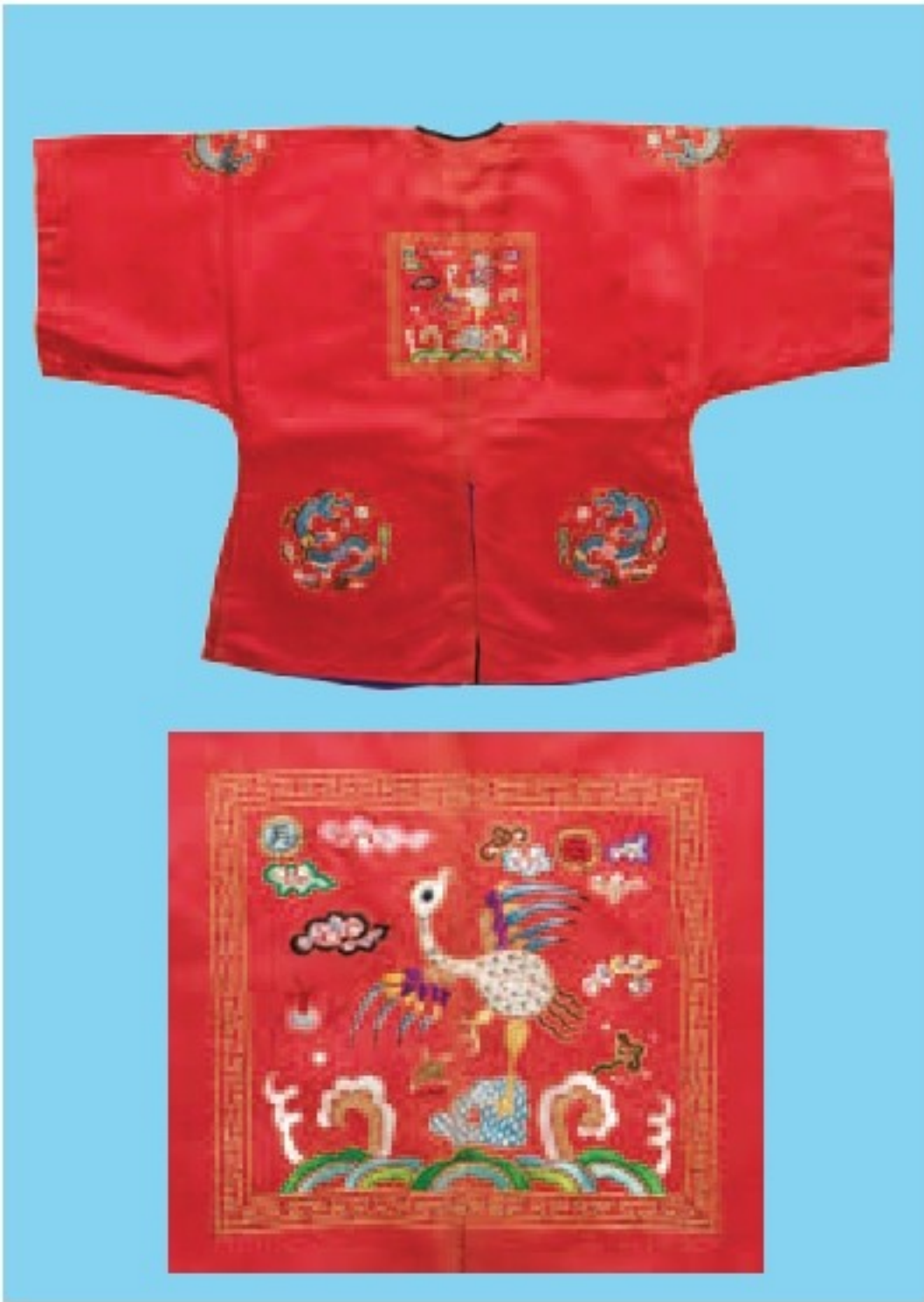
Child's surcoat with third rank badge and detail of badge c 1825, donated to the Art Gallery of New South Wales.