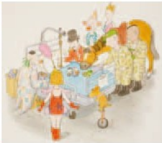
Illustrations by Bob Graham, donated to the Lu Rees Archives, University of Canberra